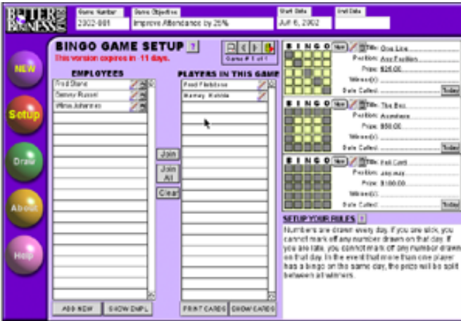
Sample of Game Setup Screen