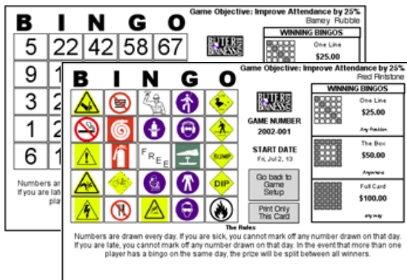
Sample of Bingo Cards Generated